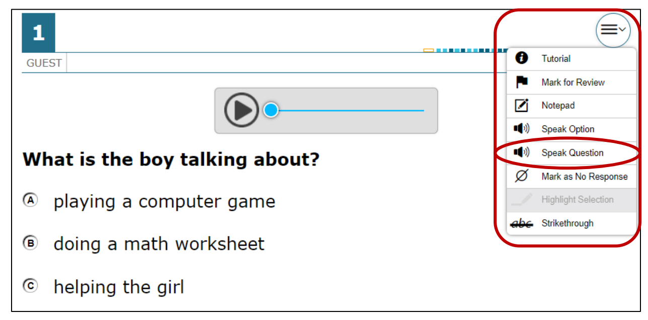
Figure 2. Context menu option for option or question

It can also be accessed through the context menu at the top-right corner of the item (figure 2).